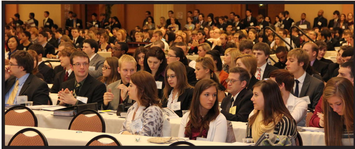
AMUN International returns to the Sheraton Chicago Hotel and Towers for the 23rd annual Conference. Welcome all! Now let's start changing the world.

7 Xi Jing Ping was recently chosen to be the new head of China. This is a once-in-a-decade leadership change that is very important in China and now the world as well. This leadership change was seen as a rebuke to Hu Jin Tao, as his choices were all rejected for the top leadership body of China. The leaders are all political conservatives, so political reform is unlikely.